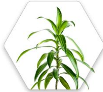
Song of India