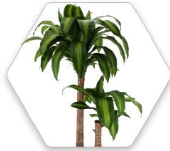
Song of Jamaica